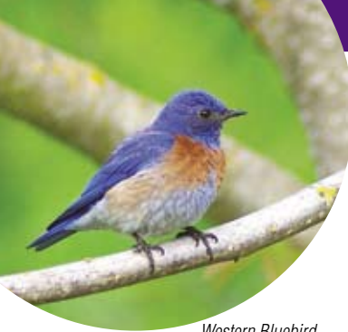
Western Bluebird