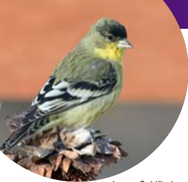
Lesser Goldfinch

parking area near the kiosk. Expect occasional closures of the ranch for orchard spraying.