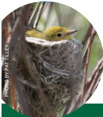
Baby Yellow Warbler